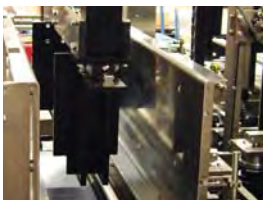
UPSTACKER WITH PRODUCT SUPPORT

Massman Automation has the right infeed solution for your product.