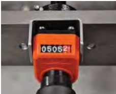
ADJUST DIGITAL INDICATOR