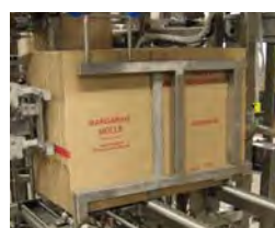
4' CASE BLANK MAGAZINE (BOTTOM LOAD ONLY)

All pictures shown are for illustration purpose only. Actual product may vary.