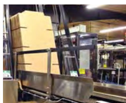
STANDARD 3' OR 6' CASE BANK MAGAZINE