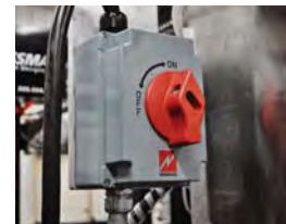
LOCK OUT - TAG OUT