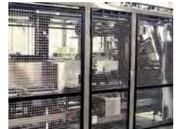
STAINLESS STEEL MESH GUARD DOORS (OPTIONAL)