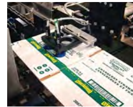
OPPOSING CUP SET-UP