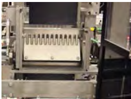
LOW SPEED BUMP UPSTACKER