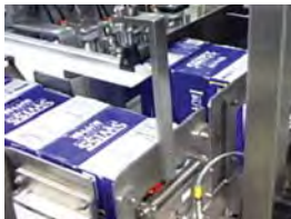
BOTTOM UP PUSH