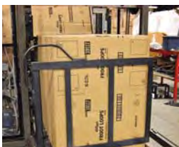
LOW LEVEL MAGAZINE