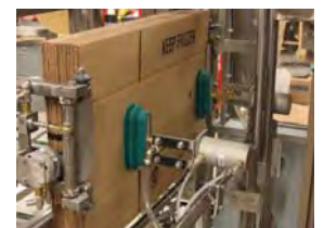
VACUUM TRANSFER (BOTTOM LOAD ONLY)