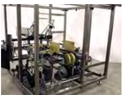
HEAVY DUTY FRAME