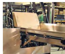
DUAL BLANK STYLE (WA, KD OR TRAY)

Massman Automation offers different case blank magazines to handle all types and sizes of corrugate and chip board blanks, with many unique design features to ensure proper blank