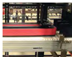
SWINGER LANE DIVIDER WITH GROUPING