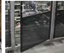
1/4" ACRYLIC GUARD DOORS