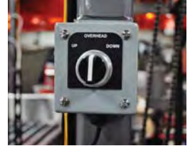
HEAVY SECTION POWER ADJUST