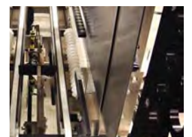
HIGH SPEED ROTARY UPSTACKER WITH SURGE/METERING BELTS