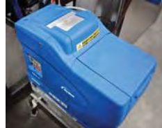
NORDSON HOT MELT GLUE SYSTEM