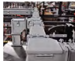
INTERFACE WIRE WAY