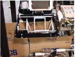
SERVO DRIVEN OVERHEAD LOADER